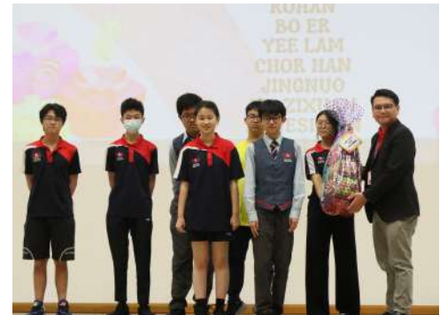
Explorace - The winning team