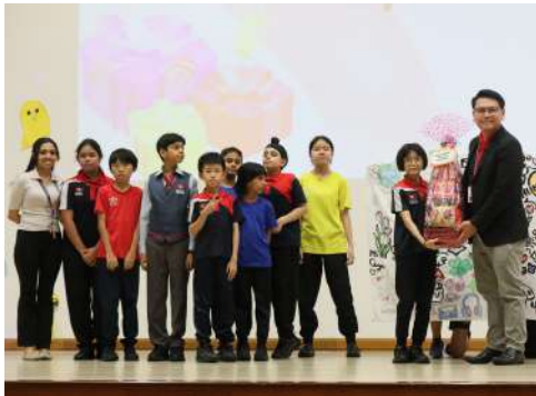
Best doodle - Year 5

To close out the ceremony, the excitement reached its peak with the much-anticipated prize giving! The most profitable stall, the most engaging booth, and the class with the best doodle were all recognised for their outstanding efforts, alongside the triumphant winners of Explorace — a well-deserved end to a week full of hard work, creativity, and school spirit!