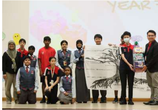
Best doodle - Year 7