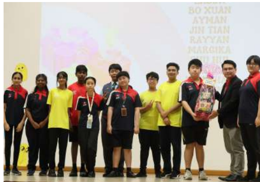
Explorace - The most spirited team