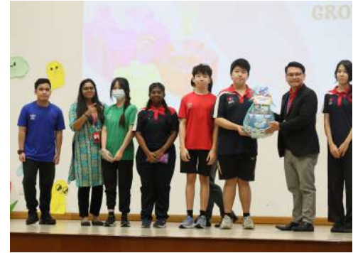
Most profitable stall - Year 10