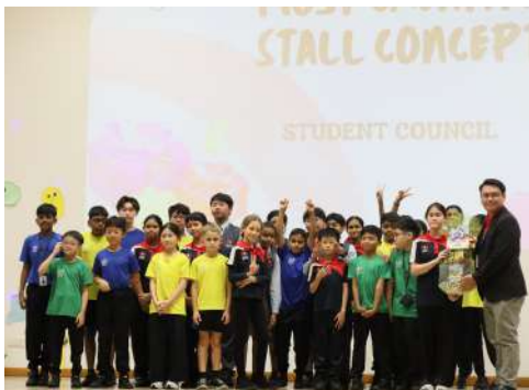
Most engaging booth - Student Council