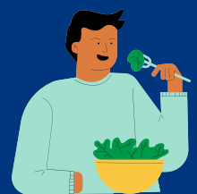
Promote healthy eating