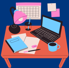
Set up a study space