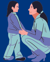
Stay positive and supportive