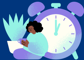
Encourage regular breaks