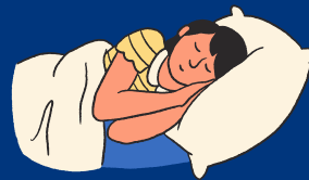
Ensure adequate sleep